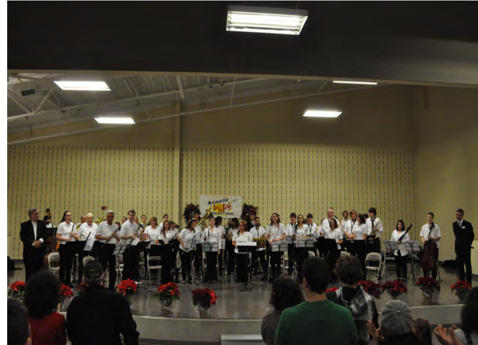
The Members of the Atlantic Pops acknowledge the audience after their performance of Leroy Anderson's Christmas Festival!